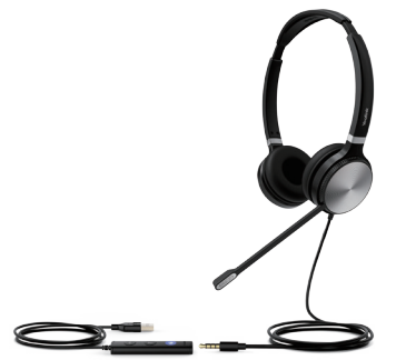
UH36 Dual Teams UH36 Dual UC